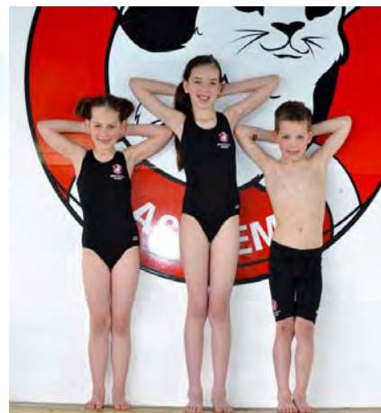
Some top models showing off their SSA bathers.

Don't forget to visit us on the web at www.ssacademy.com.au for all the up to date information and news